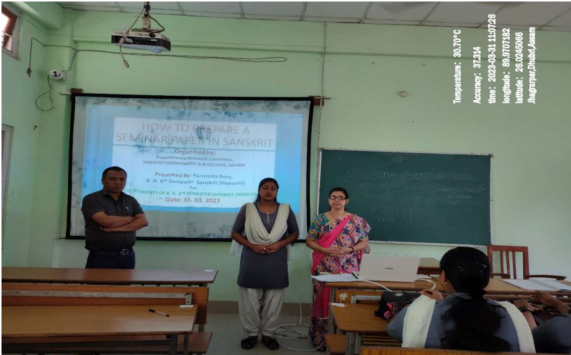
Teachers present in the Class